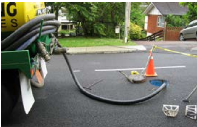
Figure 2: Sediment is removed from the sump with a vactor hose. Confined space entry is not required for this step.