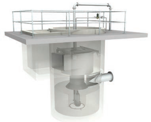
Fig.2 Grit King® (below ground configuration)