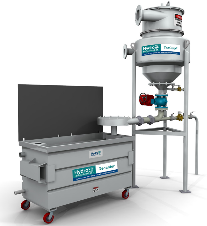
TeaCup® / Decanter with Optional Pressure Cap Design