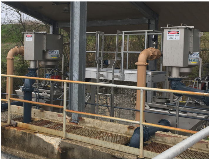
TeaCup® / Grit Snail® Systems with Standard Discharge Box Design