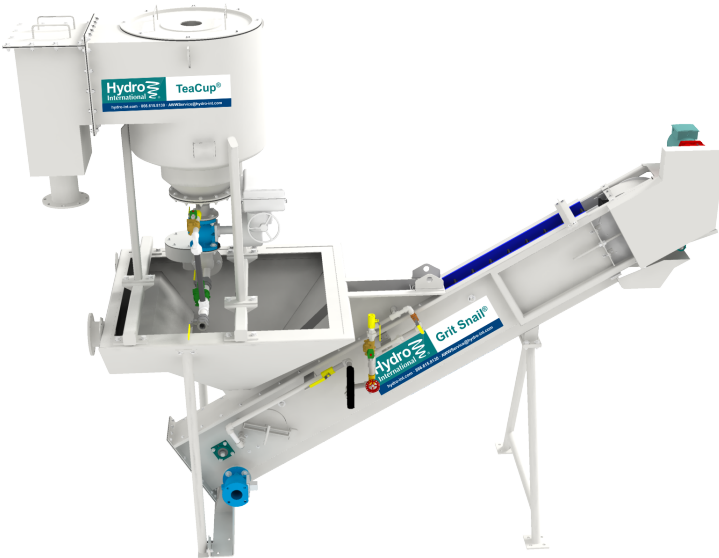
TeaCup® / Grit Snail® with Standard Discharge Box Design

» Inlet and outlet can be oriented to accommodate many piping configurations.