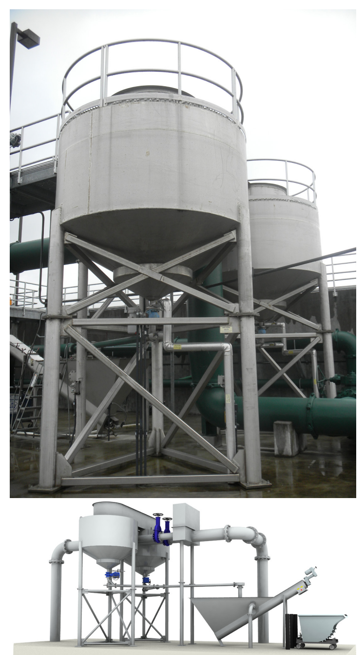
Free Standing Grit King® and Classifier System