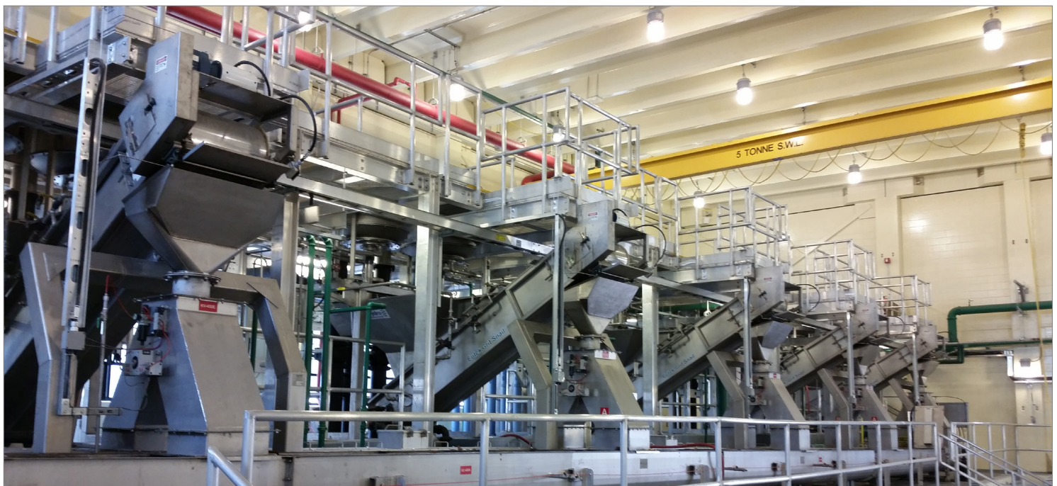
Bonnybrook's 5 Grit Snail Units Output Grit with Greater than 60% TS

Commissioning included successful performance testing of the Hydro grit removal system by an independent third party. Zorica Knezevic concludes: “After commissioning, the Bonnybrook grit removal plant continues to perform well. ”