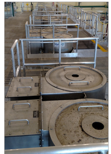
Bonnybrook's Covered HeadCell Units (Left) SlurryCup Units (Right)

"High performance grit removal ... achieve[s] lower operation & maintenance costs & retain[s] ... capacity of ... bioreactors, fermenters, & digesters."