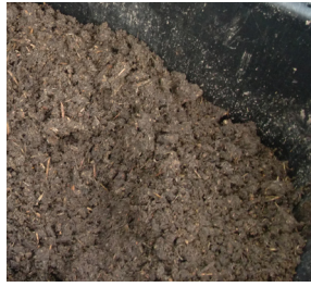
Particle Board Screening