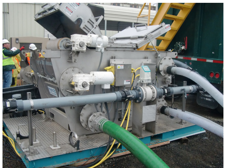
Gets 30-50% TS and Uses 80% Less Energy than Primary Clarifiers